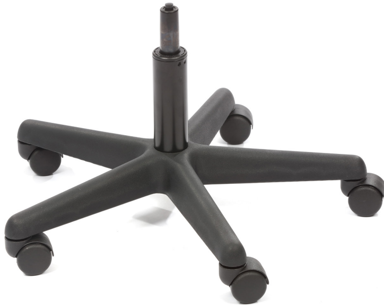
Image shows Bridge chair base fitted with RGE602 castors and a RGE222 gas lift