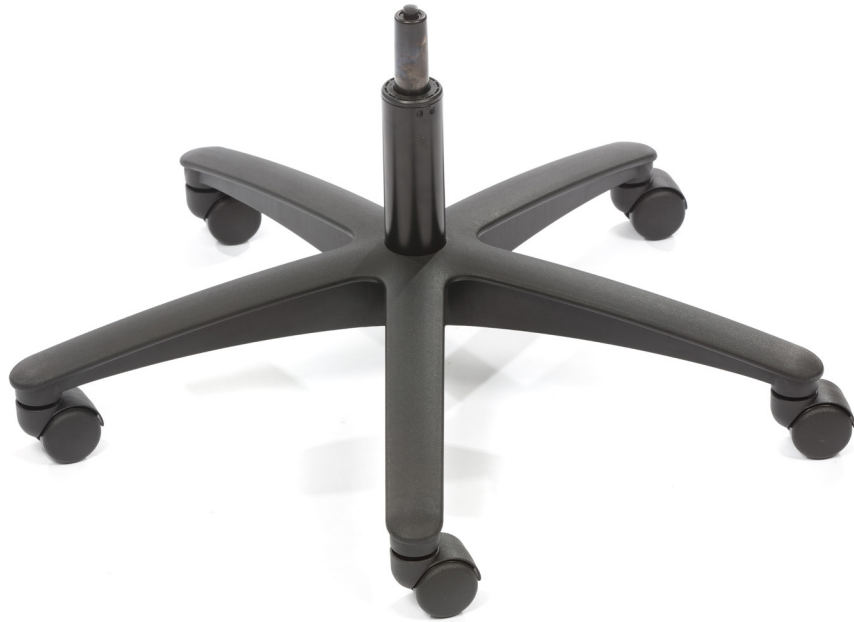
Image shows Clifton chair base fitted with RGE602 castors and a RGE225 gas lift