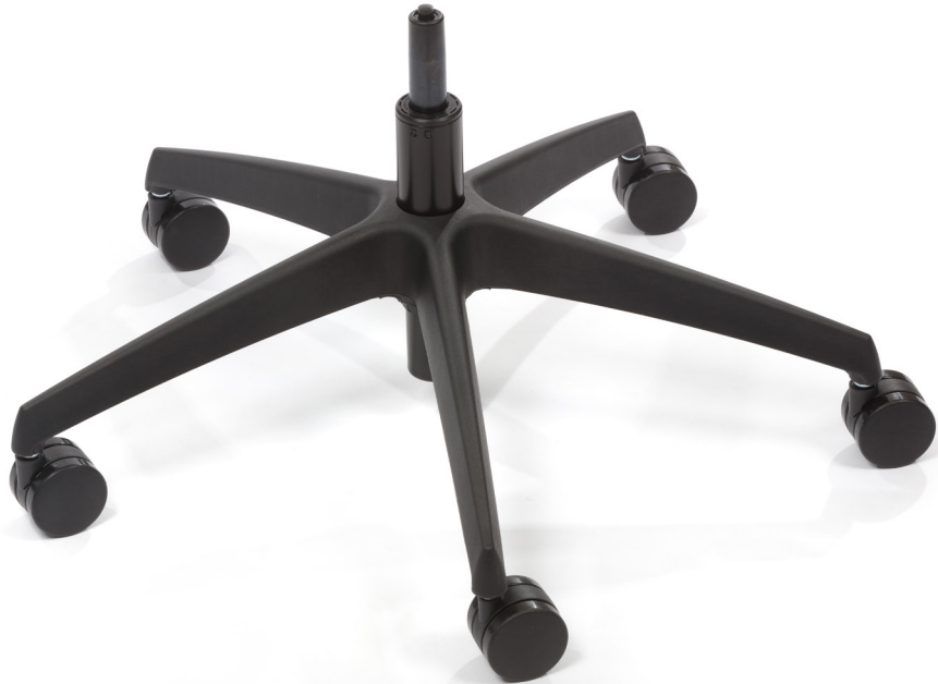
Image shows Delanco chair base fitted with RGE643 castors and a RGE229 gas lift