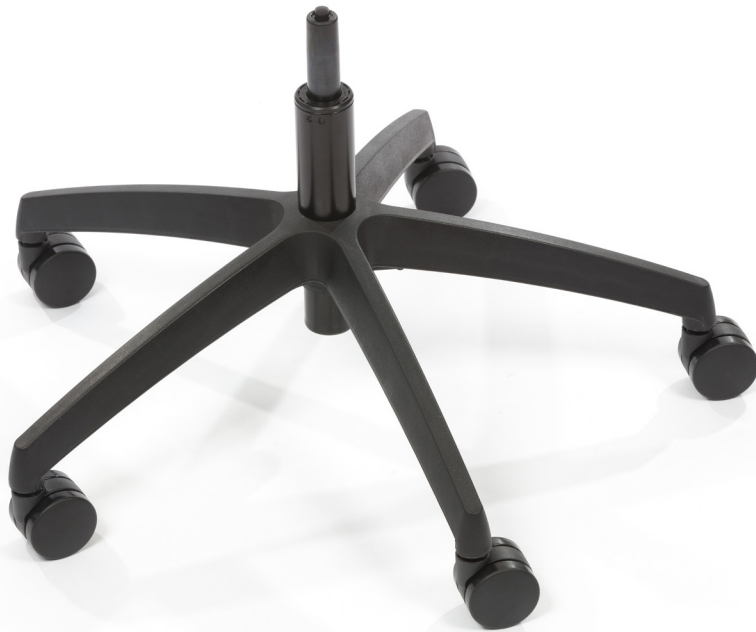
Image shows Knightsbridge chair base fitted with RGE647 castors and a RGE229 gas lift