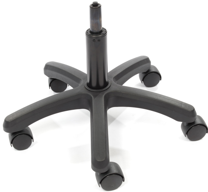
Image shows RGE700 chair base fitted with DRK castors and a RGE221 gas lift