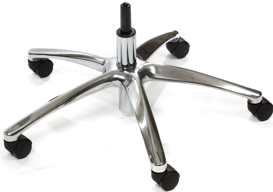
Image shows RGE704 chair base fitted with RGE602 castors and a RGE229CHR gas lift