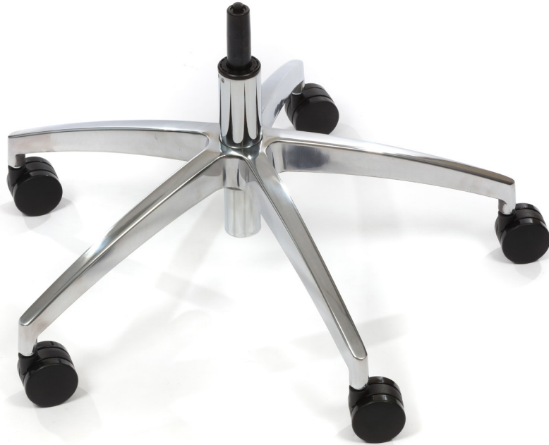
Image shows RGE707 chair base fitted with RGE632 castors and a RGE229CHR gas lift