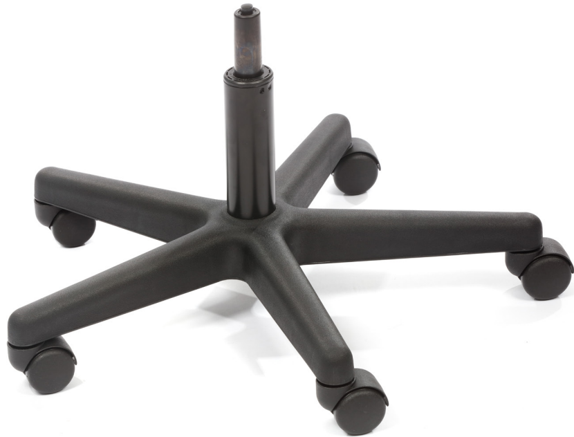
Image shows Warwick chair base fitted with RGE602 castors and a RGE222 gas lift