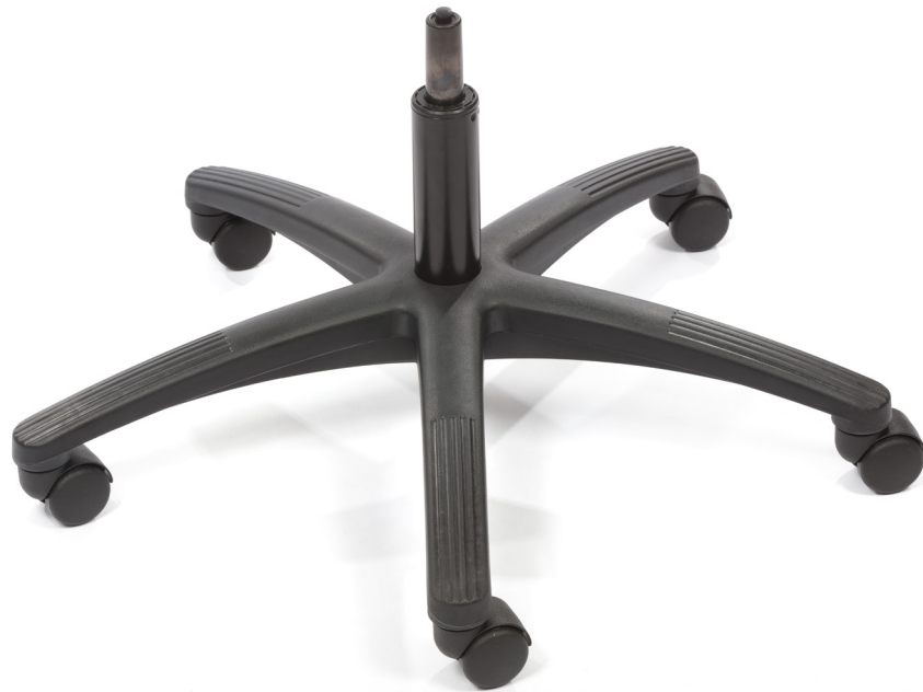
Image shows Worcester chair base fitted with RGE602 castors and a RGE225 gas lift